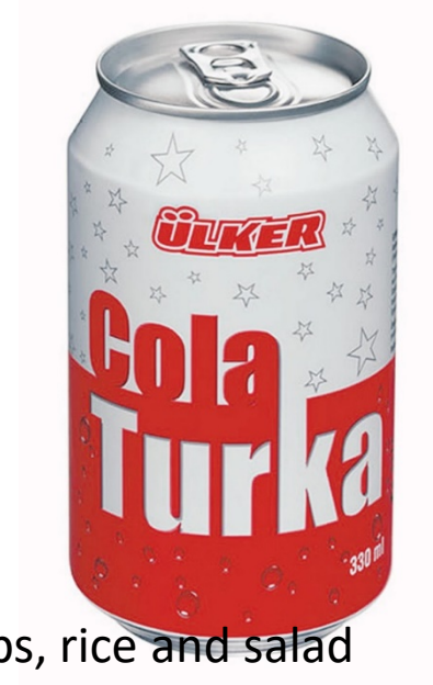
Turkish kebabs, rice and salad