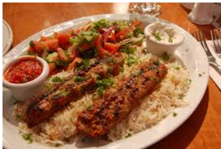
Turkish kebabs, rice and salad

I like learning about the Turkish language and culture. These are some of the sounds in the Turkish language