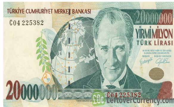
The currency in Turkey is the lira