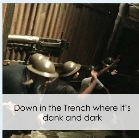
Down in the Trench where it's dank and dark