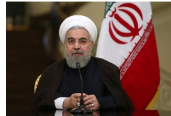
The President is Hassan Rouhani