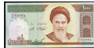
The currency in Iran is the rial