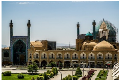
The Imam Mosque in Isfahan