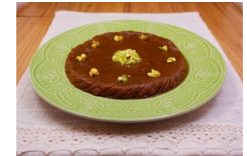
Traditional dishes in Iran include jewelled rice and halva